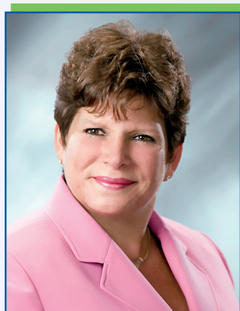
COMPLIMENTS OF SENATOR CHRISTINE M. TARTAGLIONE