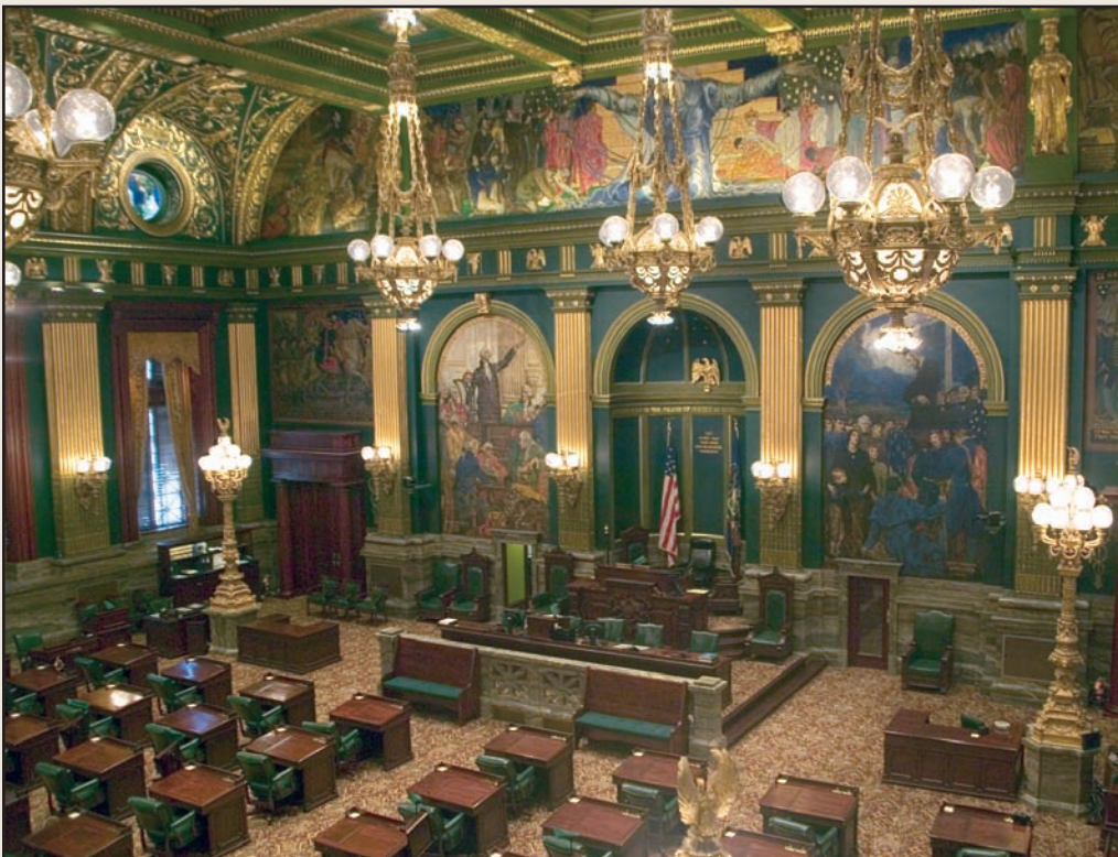
THE SENATE CHAMBER

THE RICHLY-APPOINTED SENATE CHAMBER is where Pennsylvania's 50 state senators meet to debate and vote upon legislation and resolutions. Groundbreaking female artist Violet Oakley spent more than eight years completing the murals. The desks are constructed of mahogany and imported from Belize. The drapes weigh 87 pounds per pair and the bronze light fixtures weigh 2 tons each.