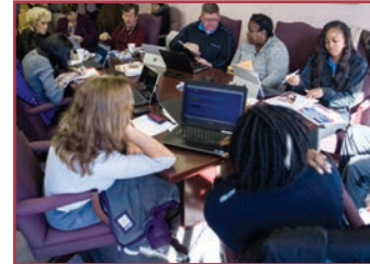
Constituents visited Senator Tartaglione's Bridge Street office in November to sign up for affordable health insurance coverage.

In November, Senator Tartaglione helped constituents relieve many of their concerns as she helped them sign up for affordable health insurance during an open house at her district office at Bridge Street and Oxford Avenue.