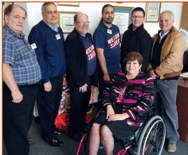
Senator Tartaglione greeted Plaza Allegheny developers and Save-A-Lot managers on opening day at her new Allegheny Avenue office.

Parking is free and ample, while the location is convenient and accessible. More than 60,000 people live within one mile of the office. Senator Tartaglione plans to hold a public Grand Opening celebration in the spring. ■